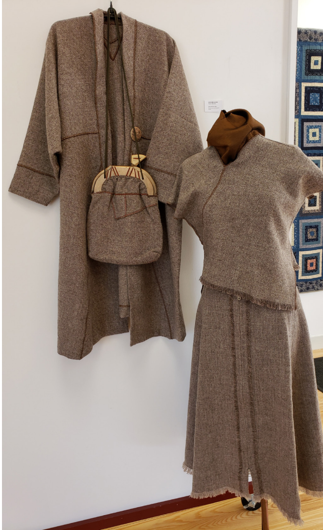
L. ALANIZ WOOL ESEMBLE