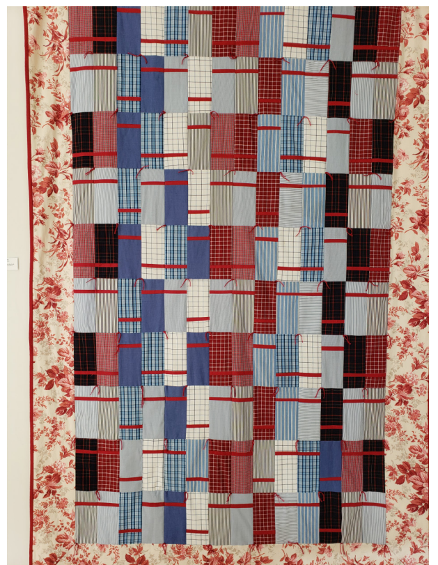
T. LANE RED, WHITE, AND BLUE BRICKS QUILT.