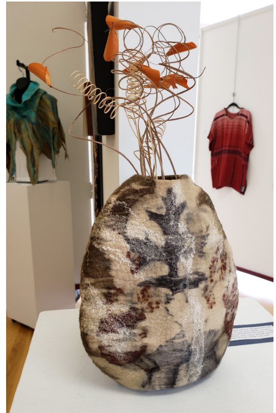
F. ROSENSTOCK LEAF VASE ECO-PRINTED HAND FELTED WOOL