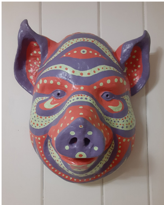
VIRGINIA BERRY PAPER MACHE PIG SCULPTURE.FRONTAL