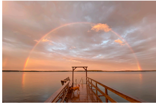
1st Prize - iPhone Camera - Sally Dillon - Rainbow at Sunset