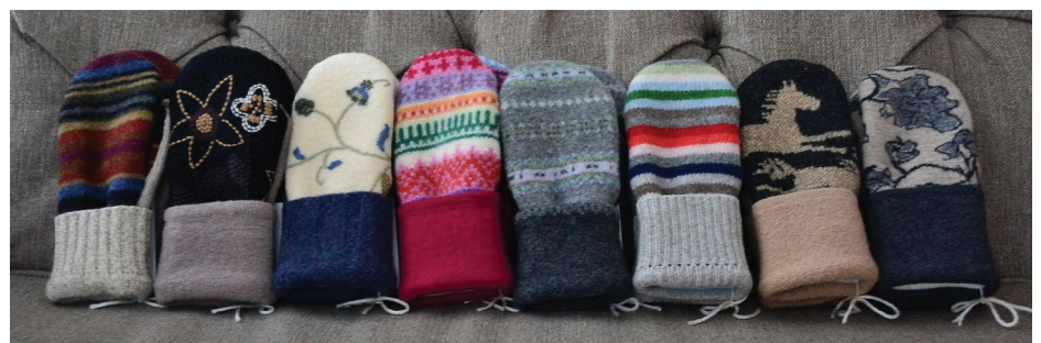
M. SAVAGE MITTENS