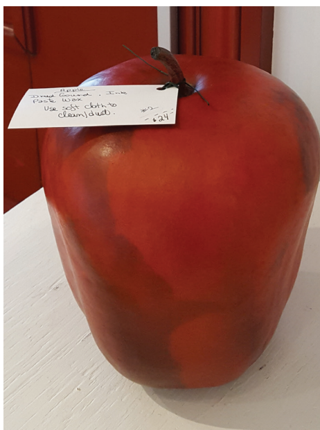
L. KEECH HOLIDAY APPLE GOURD