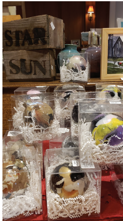
C. DUNN HOLIDAY BALLS