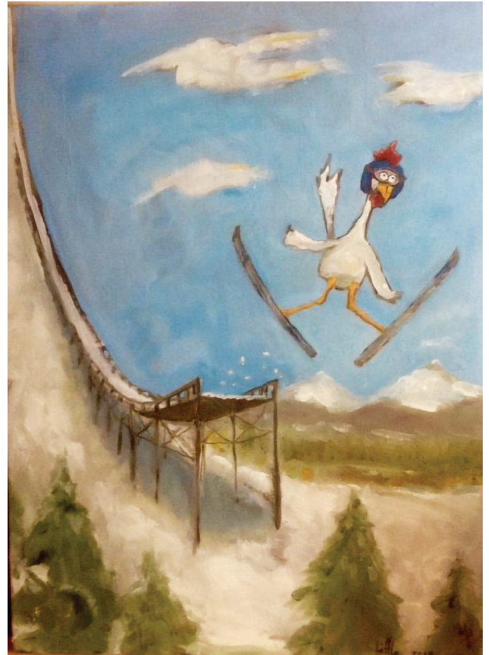
P. LITTLE COSMIC SKI JUMP