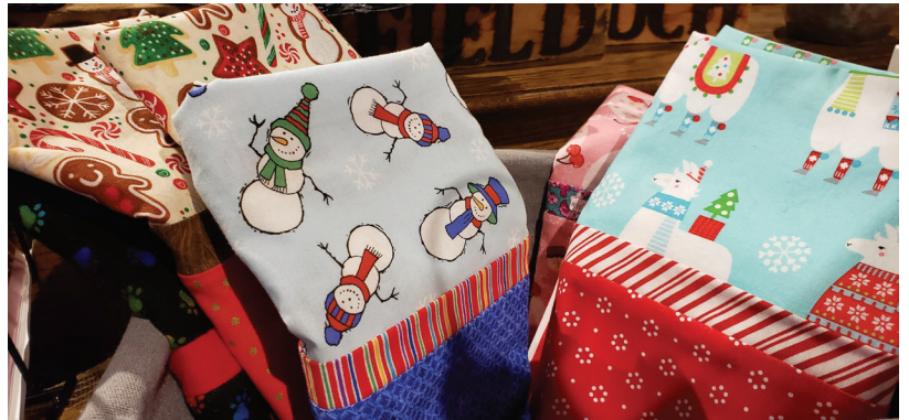
M. STANCER FLANNEL PILLOWCASES