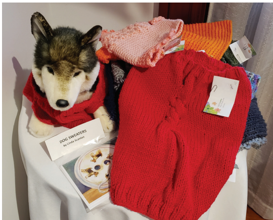
L. SCANLON DOG SWEATERS