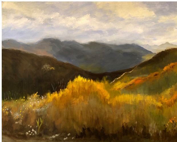
L. Bower Cottonwood Canyon, Utah