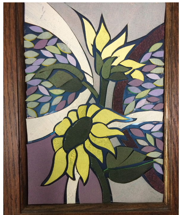
Seeds. (Sunflowers are my favorite flower)

I've done 6 panels. 6 more to go to finish first cabinet. One will have to be a corona virus (representing clever viruses everywhere). More pics of my progress (next page) . . .