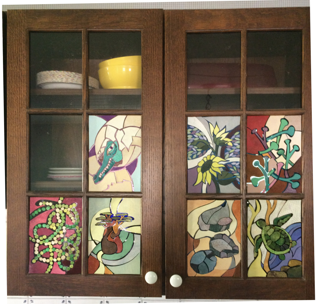
“hard shelled egg” (allowing reptiles to flourish)

COMING SOON! The 2020 season opening of the NORTHFIELD FARMER'S MARKET will be THURSDAY JUNE 4 FROM 3-6PM IN FRONT OF THE DVAA CENTER FOR THE ARTS & CAMERON'S WINERY. Due to the Covid-19, no crafts will be allowed, at least not in the beginning of the season so vendors will be limited. Coyote Hill Farm will be back and several other food vendors are waiting for certificates from the Board of Health. DVAA is currently managing the market. If you are interested in participating, contact margedvaa@gmail.com . Produce, food processed in a certified kitchen such as bread, meats, jams, etc, eggs, honey, maple syrup, flowers and plants are currently allowed. Masks must be worn on the premises during the market and social distancing rules apply. Many thanks to CISA for providing signs. Looking forward to seeing local neighbors supporting local farmers.