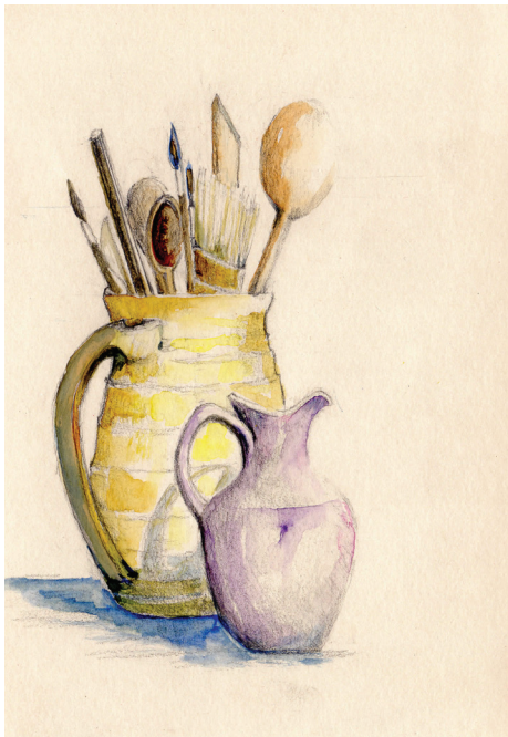
M. Moore Still Life, colored pencil

I have been coping by committing myself, finally, to a Daily Painting routine in which I create one small painting (usually 5x7) each day and I post it on Instagram. The Daily Painting movement has been ongoing for some time, but I was full of excuses, “too busy”. Ha ha, bit of an exaggeration and now it doesn’t actually apply, so each day I produce some small thing, and sometimes some larger thing too! You can see me at Instagram: