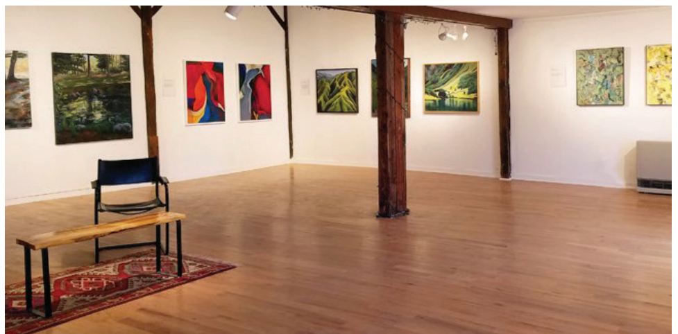
LCA Barnes Gallery

This a great opportunity for the artists of each organization to expand their exposure to the public. The shows are open, meaning they are non-themed and non-juried.