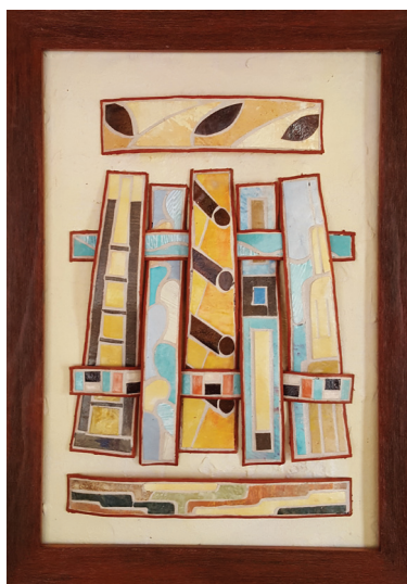
P. Pitts Adobe